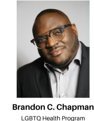
Manager Columbus Public Health